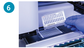
Place a PCR cartridge in the reader