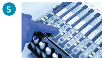
Load Unitized Reagent Strips with extraction and PCR reagents