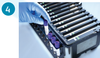
Add Sample Buffer Tube to rack

The BD MAX™ System provides a streamlined and efficient way to run molecular assays that improves turnaround time for fast, appropriate treatment decisions. The pre-filled reagent strips contain all the materials needed to complete the test per sample so there is no waste.